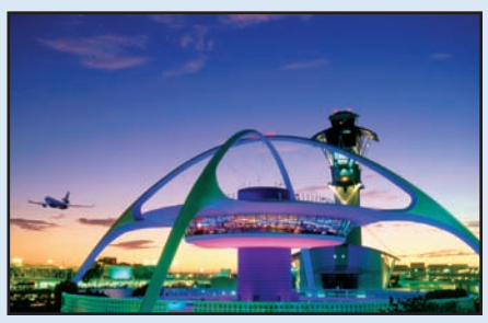
LAX Airport Los Angeles, California