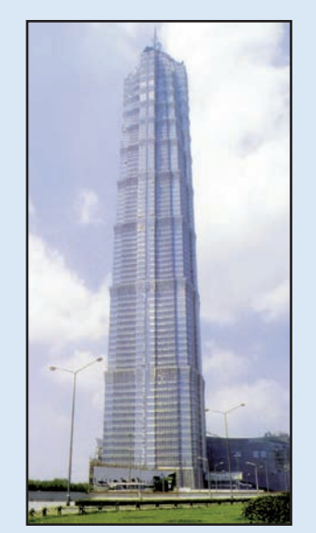
Jin Mao Shanghai, China