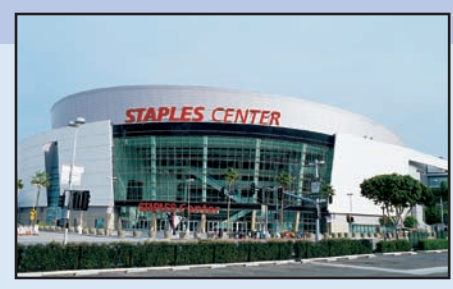
Staples Center Los Angeles, California

Sony Pictures Stage #11 - Culver City, CA Motorola Cellular Subscriber Group - Harvard, IL CBS/Studio Center - Studio City, CA Disneyland - Anaheim, CA Exxon Headquarters - Houston, TX Legoland - Carlsbad, CA Polygram Records - Miami, FL Sun Micro Systems - San Diego, CA Warner Bros. Technical Operations - Glendale, CA Federal Express - San Francisco, CA Lucent Technologies - Murray Hills, NJ Universal Studios Hollywood - Universal City, CA Callaway Golf - Carlsbad, CA Nokia Building - San Diego, CA E! Entertainment Television - Los Angeles, CA USA Today - McClean, VA Sprint PCS - Kansas City, KS Ford Motor Corporation - Detroit, MI General Motors Electric Motor Testing - La Grange, IL Paramount Studio - Gardena, CA State Farm Insurance - Greeley, CO Amgen - Phase 2 - Thousand Oaks, CA TRW - Huntsville, AL Turner Entertainment - Atlanta, GA Boeing - Bldg 203 - Anaheim, CA Cox Communications Studio - Phoenix, AZ