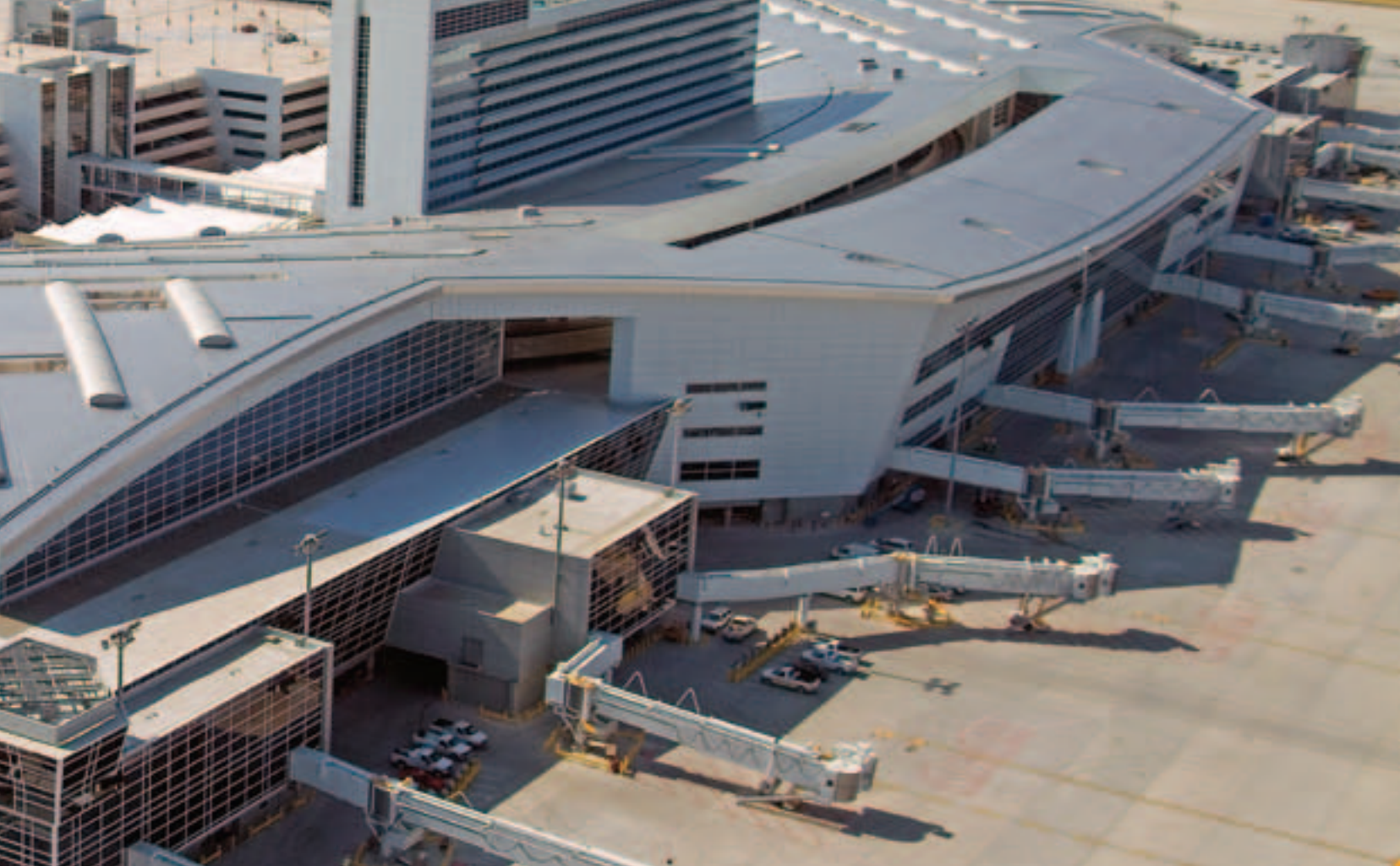
▲ Dallas/Fort Worth International Airport, Dallas, TX