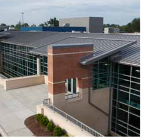
Charlestown High School, Charlestown, IN

Air Infiltration: Tested according to ASTM E 1680 Water Infiltration: No leakage when tested accord-