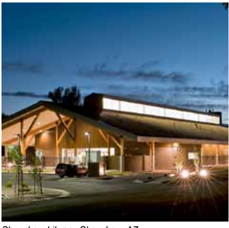
Show Low Library, Show Low, AZ

Performance of Exterior Windows, Doors, Skylights and Curtain Walls by Uniform Static Air Pressure Difference.