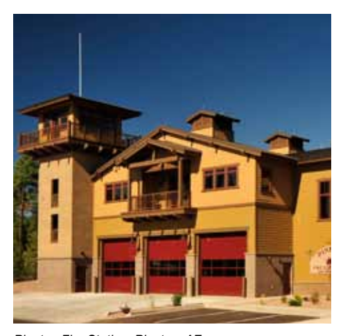
Pinetop Fire Station, Pinetop, AZ

No specific maintenance is required for properly installed Metal Sales standing seam panel products.