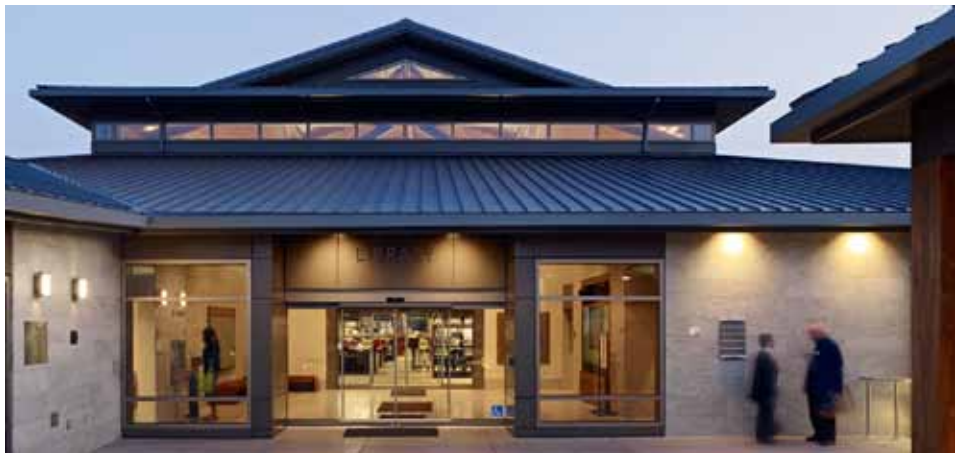
Lafayette Library and Learning Center, Lafayette, CA

Verify that site conditions are acceptable for installation. Do not proceed with installation until unacceptable conditions are corrected. Comply with pan-