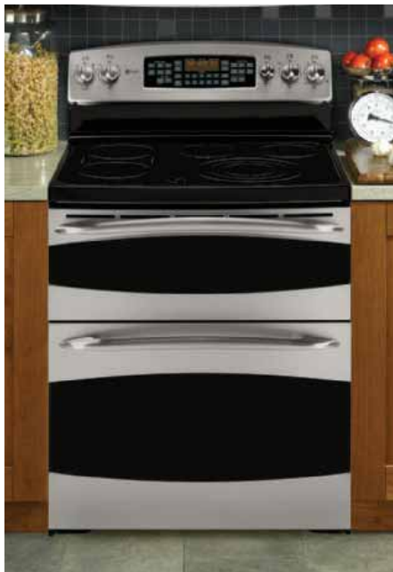
PB975 GE Profile 30" double electric oven range