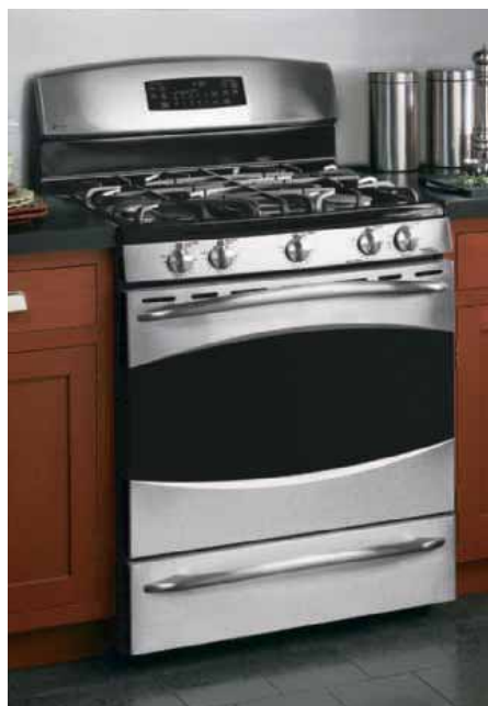
PGB908 GE Profile 30" gas range