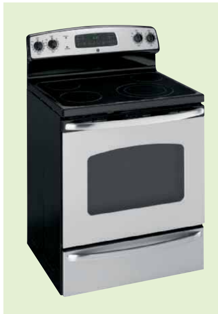
JBP66 GE 30" electric range