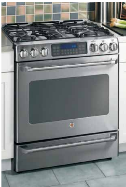
CGS980 GE Café 30" gas range