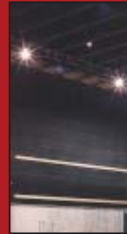
(Above) Charcoal Monoglass application; Paramount Pictures Film Studio