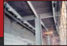
(Top & Bottom) Gray Monoglass application; Ohio State University Stadium

Perfect for use in Film Studios, Theaters, Night Clubs, Gymnasiums and Restaurants. Monoglass Spray-On gives an attractive finish and excellent thermal and acoustic insulation performance all in one product. Monoglass also provides the added safety of a non-combustible, combined with higher thermal resistance (R-4.0 per inch) than combustible cellulose insulations.