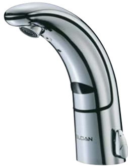
Optima® i.q.™ EAF-100 Optima® i.q.™ EAF-150

Optima® i.q.™ EAF-100 electronic faucet operates by means of a dual infrared sensor and microprocessor-based logic that utilizes self-adapting technology to ensure superior performance. The modular design incorporates all of the operating components of the faucet, including the sensor, solenoid and circuitry, above the sink within a die-cast metal spout. A water-saving 0.5 gpm/1.9 Lpm spray head is available as an option.