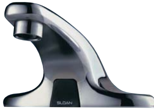
Optima® ETF-600 Optima Plus® EBF-650

Optima® ETF-600 electronic faucet operates by means of an infrared sensor. Once the user's hands enter the sensor's effective range, the solenoid activates the water flow. Tempered water flows from the faucet until hands are moved away. The faucet then automatically shuts off. The ETF-600 conserves water with its standard 0.5-gpm spray head.