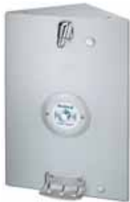
TouchTime in a corner wall shower