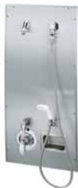
Equa-Flo EF in a recessed ADA wall shower