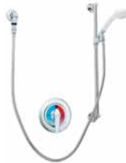
Navigator with hand shower