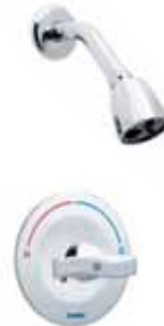
Equa-Flo C5 with a commercial showerhead