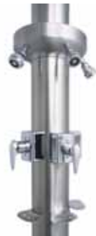
Equa-Flo HD in a column shower