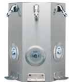
Air metering in a group wall shower