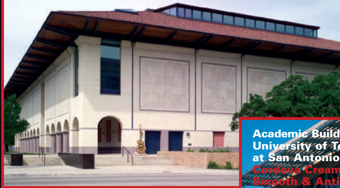
Academic Building, University of Texas at San Antonio Cordova Cream Smooth & Antigua