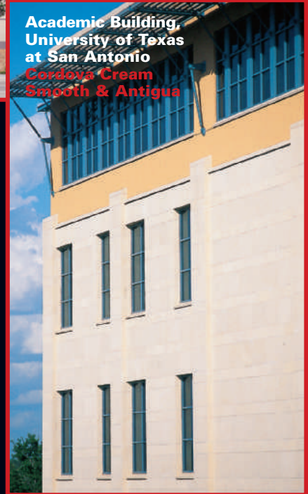
Academic Building, University of Texas at San Antonio Cordova Cream Smooth & Antigua