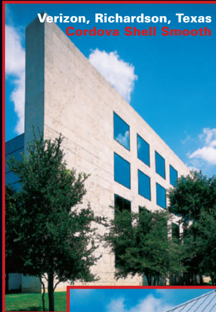
Verizon, Richardson, Texas Cordova Shell Smooth