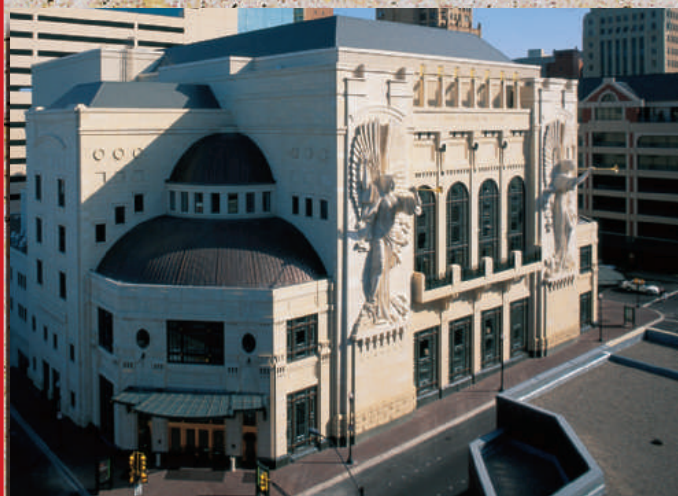
Bass Performance Hall, Fort Worth, Texas Cordova Cream Smooth

We quarry and fabricate limestone indigenous to Texas—Cordova Cream and Shell from the Hill Country, and Lueders from the Abilene area. Texas Quarries limestone has been the natural selection for countless public buildings, schools, hospitals, office buildings, monuments, and selected residences. Our limestone is available in a variety of finishes, and serves as an excellent choice for both interior and exterior applications.