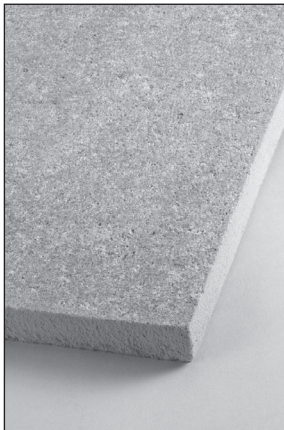
EnergyGuard™ Perlite Roof Insulation

(1) Note: Physical and thermal properties shown are based on data obtained under controlled laboratory conditions and are subject to normal manufacturing tolerances.