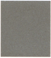
ANODIC BRONZE MICA PVDF 2