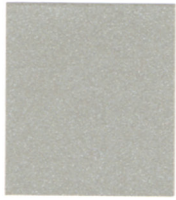
TITANIUM METALLIC PVDF 3/SRI 46