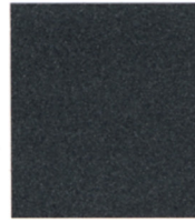
GRAPHITE MICA PVDF 3/SRI 6