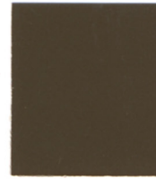
COCOA BEAN PVDF 3/SRI 31