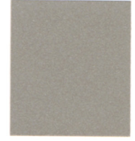
COPPER METALLIC PVDF 3/SRI 35