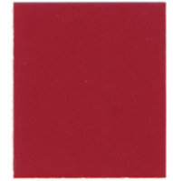
ROASTED RED PEPPER PVDF 3/SRI 41