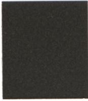
ANODIC DARK BRONZE MICA PVDF 3/SRI 6