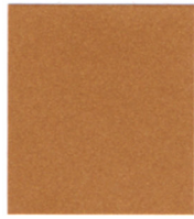
COPPER PENNY PVDF 2