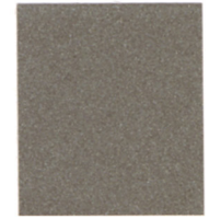
DRIFTWOOD PVDF 2/SRI 40