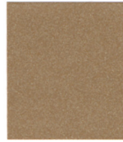
ROMAN BRONZE PVDF 2/SRI 33