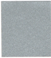
WEST PEWTER PVDF 2