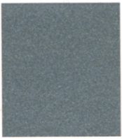
STEEL CITY SILVER PVDF 2/SRI 37