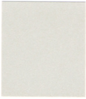
MARKET WHITE PVDF 2