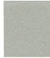
CASHMERE MICA PVDF 2