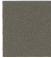
SUMMER SUEDE PVDF 3/SRI 27