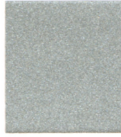
SOUTHWEST GOLD METALLIC PVDF 3