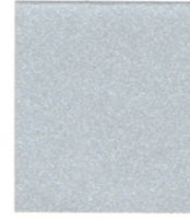
CHERRY SMITH SILVER PVDF 2