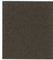
BISTRO BRONZE PVDF 2