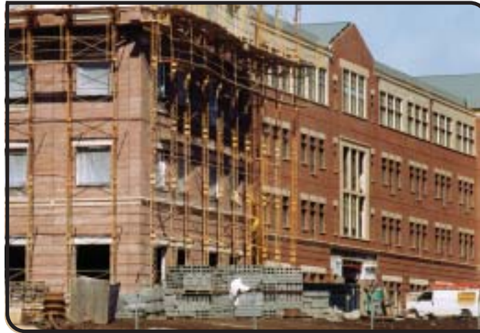
The Sprint Campus in Overland Park, KS, shows the dramatic difference made by post-construction cleanup with Sure Klean® 600 Detergent, the nation's number-one selling proprietary cleaner for brick.

PROSOCO wants you to succeed. When it's time to clean off the mortar and grout smears, oil, grease, dirt and other soiling, PROSOCO has the products, information and technical support you need to leave your project — and your reputation — looking sharp.