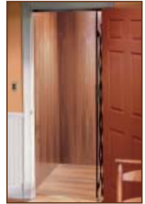
200 Smooth hardwood veneer panels with square, flush corners