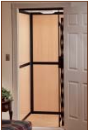
100 Aluminum frame with hardwood veneer or laminate veneer snap-in panel machine room only