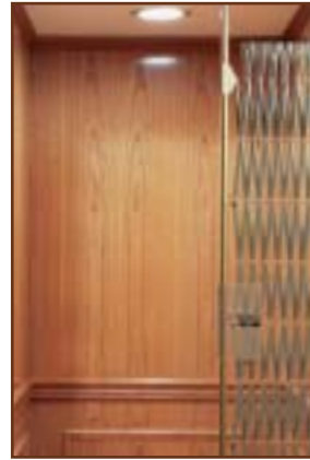
300 Smooth hardwood center panels with crown, chair, baseboard and picture molding