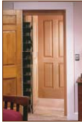
400 Solid wood with hardwood veneer raised or recessed center panels 2-over-2 or 1-over-1 panel configuration