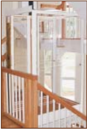
500 Metal frame with acrylic panels no shaft; machine room only