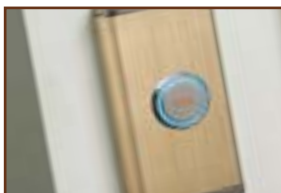
Car Operating Plates