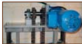
Gear Motor Chain Drive Machine Roomless • Simple and reliable • Chain for raising/lowering • Double rail chassis • 950 lb. capacity • Can accommodate car size up to 15 sq. ft. • Emergency battery lowering • Microprocessor-based controller • Self-diagnostic