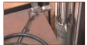
Hydraulic Drive Machine Room • Smooth, quiet ride • Patented monorail guiding system • 750 lb. and 950 lb. capacity • Can accommodate car size up to 15 sq. ft. • Emergency battery lowering