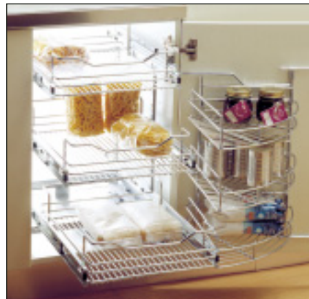
Virtú Easy Corner