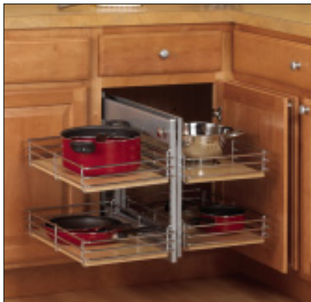
Base Blind Corner Unit