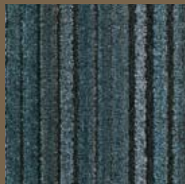
Delft & Gray FT-3