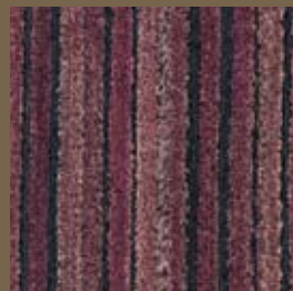
Cranberry & Gray FT-4