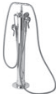
B-0190 Combination Kettle Filler and Spray Stanchion