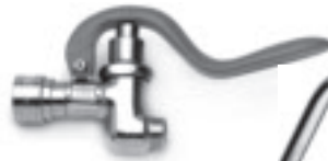
B-1424 Hook Nozzle

Attachments shown below are used with the B-1420 valve