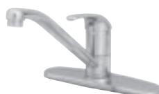
B-2731 Single Lever Mixing Faucet