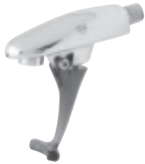
B-1205 Push Back Glass Filler