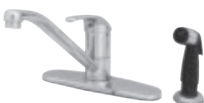
B-2730 Single Lever Mixing Faucet