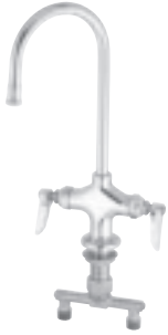
B-0871 Centerset Faucet