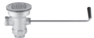
B-3940 Twist Waste Valve with Drain Adapter