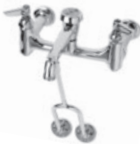
B-0665-BSTP Service Sink Faucet

Wall-mount faucet with bottom support brace, vacuum breaker and 8" centers