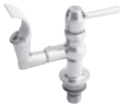
B-2991 EasyInstall Metering Faucet