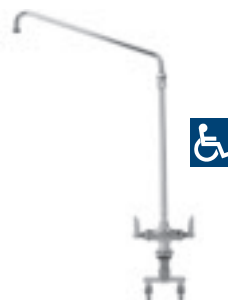
B-0270 Double Pantry Faucet with Elevated Swing Nozzle