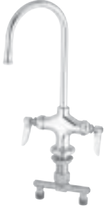
B-0300 Rigid Mixing Faucet