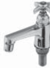
B-0710 Single Hole Base Faucet