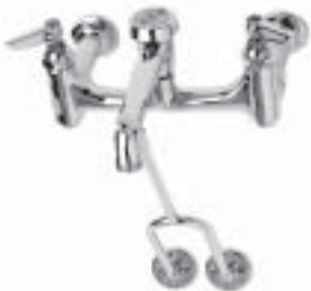
B-0665-BSTP Service Sink Faucet

Wall-mount faucet with bottom support brace, vacuum breaker and 8" centers