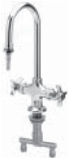
BL-5709-01 Single Ledge Faucet

Lab faucet with 1/2" male inlets, single hole faucet with under counter spreader assembly