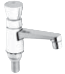
B-0712 Push Button Metering Faucet