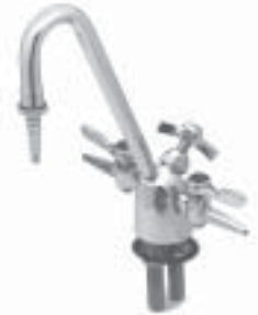
BL-4250-02 Double Panel Flange

Gas and water fixture with dual hose cocks