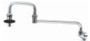
B-0605 Pot and Kettle Filler

With flexible stainless steel hose (B-0068-H)