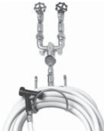
MV-2516 Rear Trigger Water Gun

MV-0771 mixing valve, water gun, brass thermometer tee, stainless steel thermometer, 50 ft. (15.25 m) high-pressure hose with brass couplings and swivel fittings, stainless steel hose rack