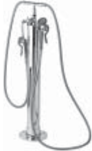
B-0190 Combination Kettle Filler and Spray Stanchion