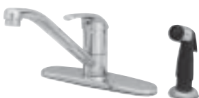
B-2730 Single Lever Mixing Faucet