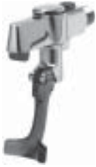
B-1205 Push Back Glass Filler