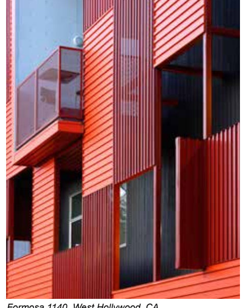
Formosa 1140, West Hollywood, CA