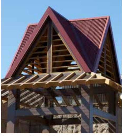
Denver Zoo, Denver, CO

•UL 790 - Standard Test Methods for Fire Tests of Roof Coverings.