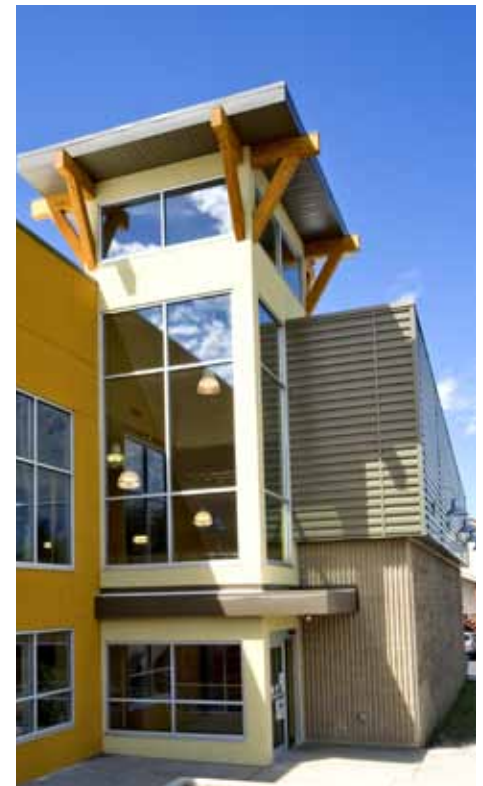
Town and Country Foods, Bozeman, MT

Additional product information is available from the manufacturer upon request. Metal Sales Manufacturing Corporation product information may be found in McGraw-Hill Sweets, ARCAT.