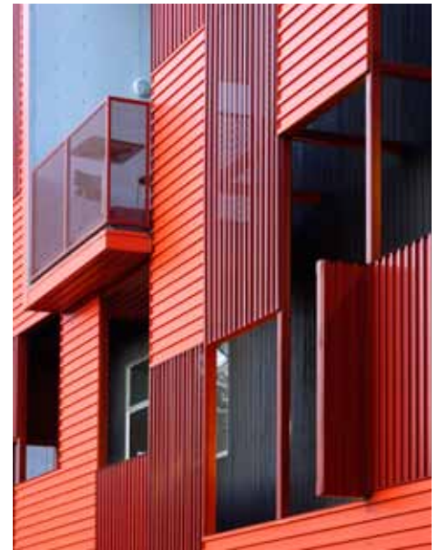
Formosa 1140, West Hollywood, CA