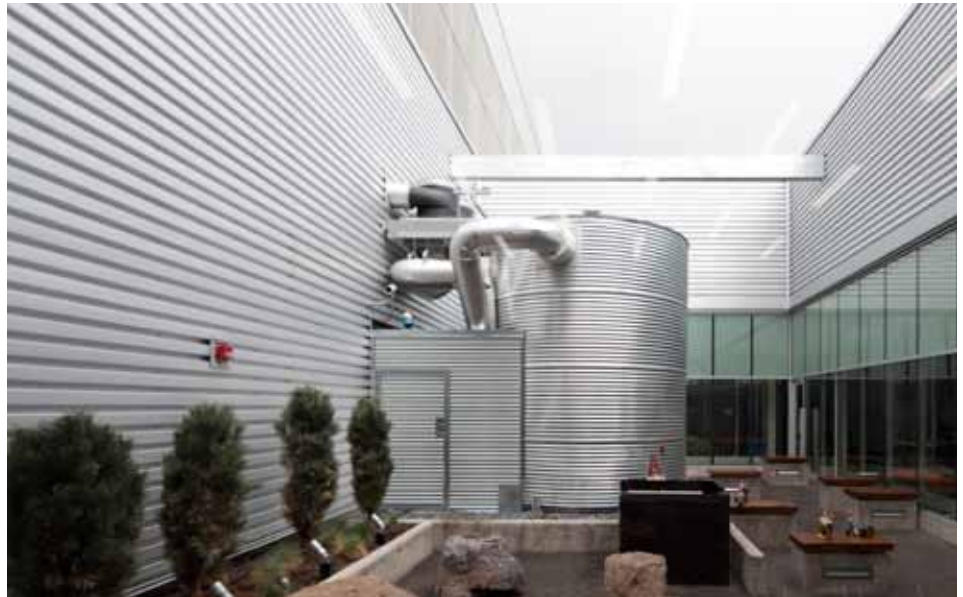
Facebook Data Center, Prineville, OR