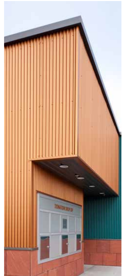
Silicon Valley Animal Center, Milpitas, CA

Additional product information is available from the manufacturer upon request. Metal Sales Manufacturing Corporation product information may be found in McGraw-Hill Sweets, ARCAT.