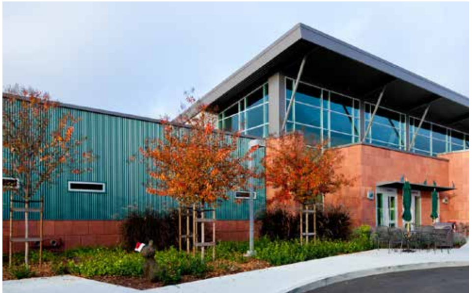
Silicon Valley Animal Center, Milpitas, CA