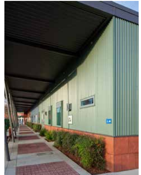
Silicon Valley Animal Center, Milpitas, CA