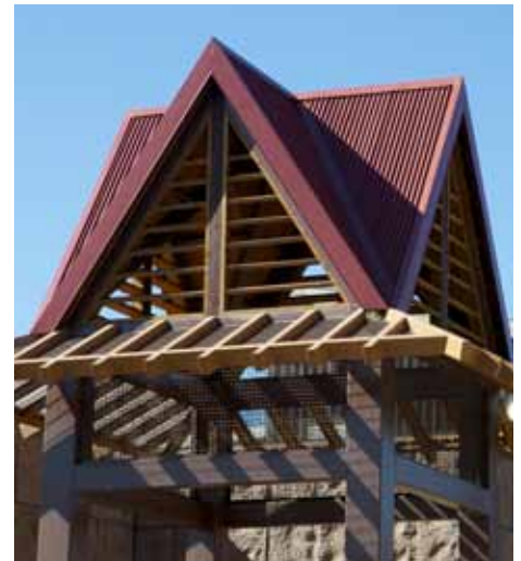
Denver Zoo, Denver, CO

●UL 790 - Standard Test Methods for Fire Tests of Roof Coverings.