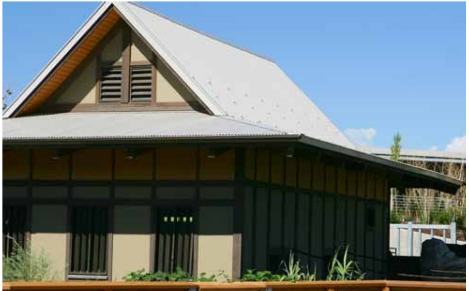
Denver Zoo, Denver, CO

Water Penetration: None at 12 psf when tested according to ASTM E 331.