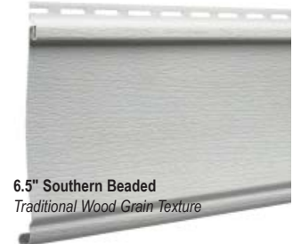
6.5" Southern Beaded Traditional Wood Grain Texture