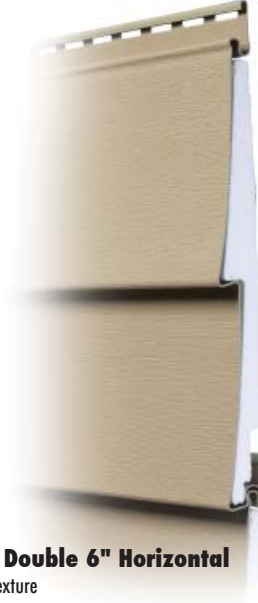
StakLoc ® Double 6" Horizontal Cedar-Grain Texture