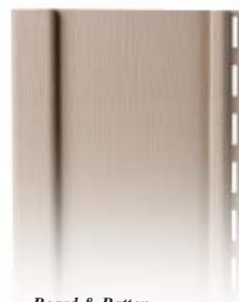
Board & Batten Cedar-Grain Texture