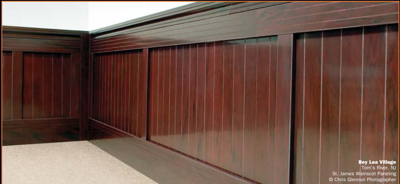
Bey Lea Village Tom's River, NJ St. James Wainscot Paneling