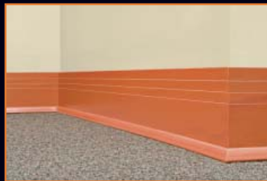
6" Wall Base shown with optional base shoe.

As with all Kwalu wall protection products, our wall guards and wall base offer the rich, warm texture of wood with the Virtually Indestructible™ durability of our proprietary polymer. Kwalu wall guards and wall bases have an anti-bacterial finish. Coordinate your base and chair moldings with other wall protection products for a complete design.