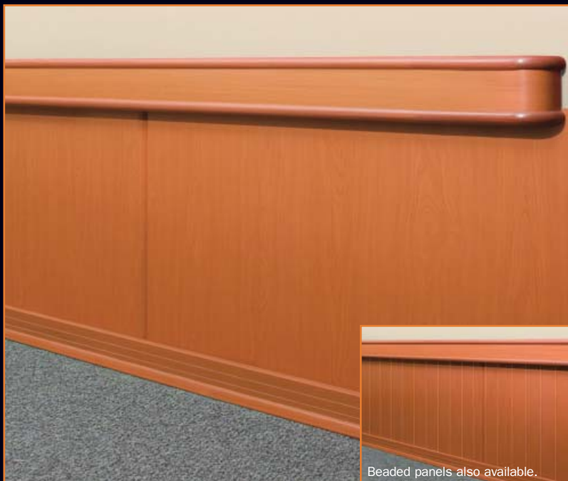
Beaded panels also available.

Kwalu Rigid Wall Covering shown with optional Transitional Handrail, 4" base rail and base shoe.