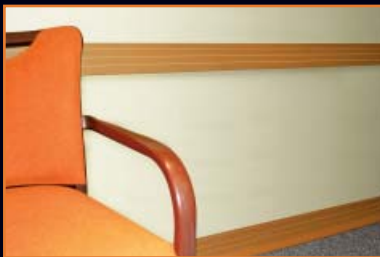
4" Wall Guard shown with Wall Base and Kwalu Symphony Chair.