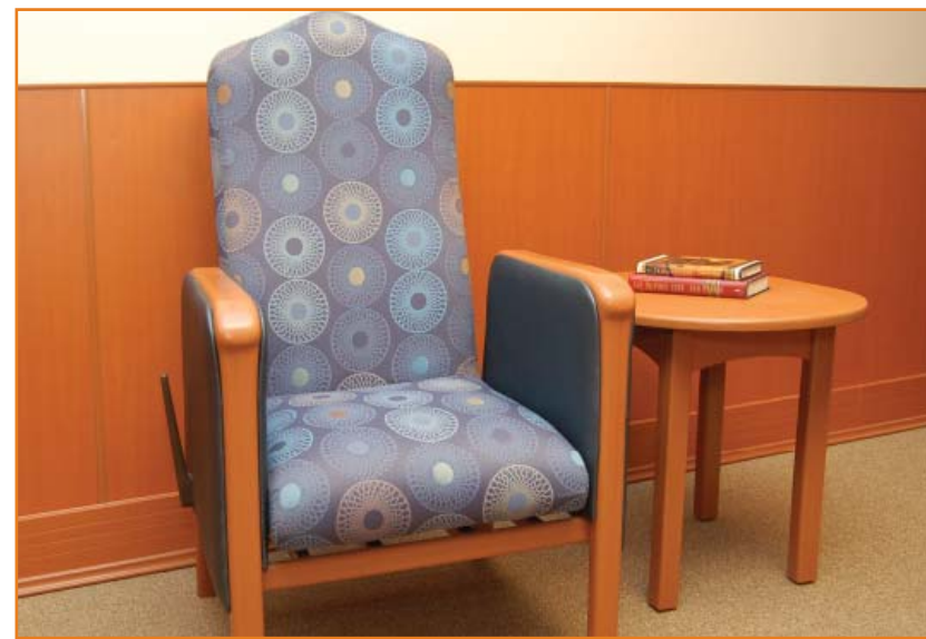
Kwalu Rigid Wall Covering with 4" base rail and base shoe shown with Kwalu Momentum chair and Edward end table

Kwalu rigid wall covering is the perfect solution for several challenging wall protection applications including moist/wet areas, (such as bathrooms), or those in which the additional thickness of the wainscot paneling components is not desirable. Our rigid wall covering can be adapted to almost any application and is well suited for tight budgets. Some products available in Kwik-Ship.