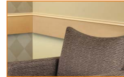
4" Wall Guard shown with optional top shoe and Kwalu Ravello chair