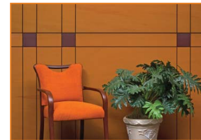
Custom Wall Paneling shown with Kwalu Symphony chair

Kwalu Wall Paneling offers the freedom to create unique designs to suit your space. Combine Virtually Indestructible™ wood grained colors with custom styles for memorable contemporary layouts.