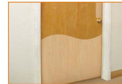
Push Plates and Kick Plates

Doors are perhaps the most vulnerable part of any facility. Kwalu kick plates and push plates are designed to prevent doorway damage while providing aesthetic appeal.