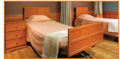
Wall Protection and Casegoods

YOUR SINGLE source Only Kwalu can ensure a coordinated look throughout your facility by offering complete collections of furniture and wall protection – all made from the same Virtually Indestructible™ Kwalu material. Buy from one trusted company to simplify your sourcing needs.