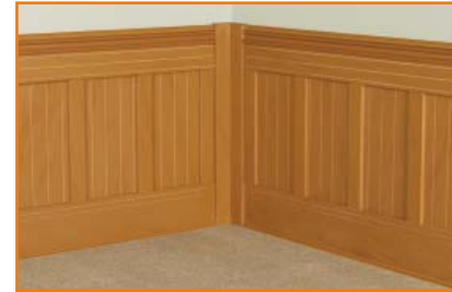
St. James traditional, linear