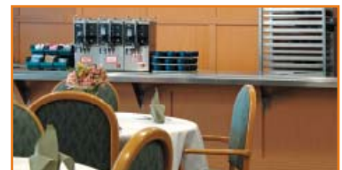
Wall Protection, Seating and Tables

SIMPLE TO install Kwalu products do not require painting or varnishing and can be installed with normal woodworking tools . Patent-pending construction methods make installation quick and easy . All Kwalu products are made from class "A" fire-rated materials.