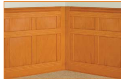
Oxford double inlay, classic, sophisticated