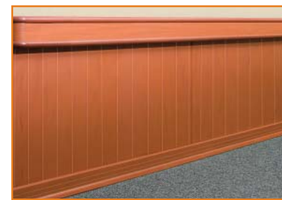
Beaded panels also available (shown with Kwalu Transitional Handrail and 4" base rail and base shoe)

Kwalu rigid wall covering is the perfect solution for several challenging wall protection applications including moist/wet areas, (such as bathrooms), or those in which the additional thickness of the wainscot paneling components is not desirable. Our rigid wall covering can be adapted to almost any application and is well suited for tight budgets. Some products available in Kwik-Ship.