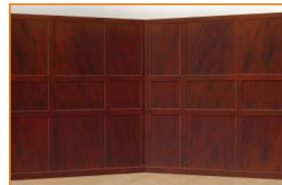
SoHo geometric, architectural, modern