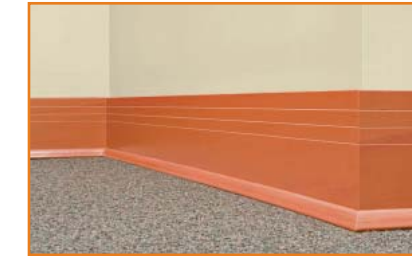
6" Wall Base shown with optional base shoe

As with all Kwalu wall protection products, our wall guards and wall base offer the rich, warm texture of wood with the Virtually Indestructible™ durability of our proprietary polymer. Kwalu wall guards and wall bases have an anti-bacterial finish. Coordinate your base and chair moldings with other wall protection products for a complete design.