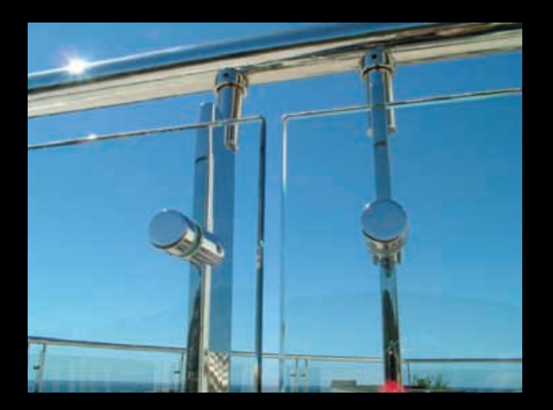
Custom residence, Emerald Bay, Laguna Beach, CA

SEGMENTED GLASS PANELS USED WITH CURVED RAIL IN LIEU OF CURVED GLASS DUE TO THE LARGE RADIUS. HIGHLY POLISHED MIRROR FINISH IS USED TO ENDURE THE ELEMENTS.