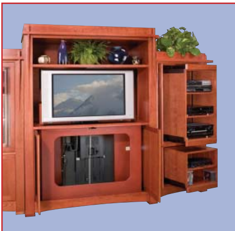
REMOTE CONTROLLED TV LIFT