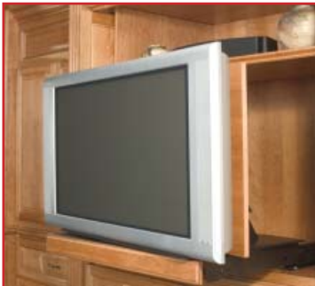
FLAT PANEL/WIDESCREEN TV SWIVEL