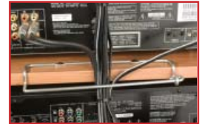
Cable Management Included