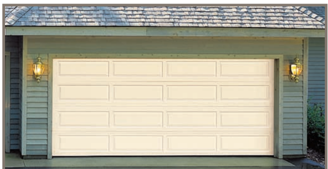
RANCH FOUR PANEL DESIGN

This sculptured, raised-panel, wood grain door is crafted with embossed panels that accentuate its stylish design. This elegant model perfectly matches the popular French Provincial design used in many of today's upscale homes.