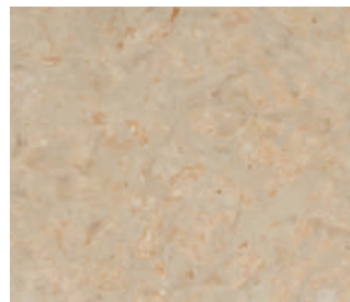
Grey Fleuri Cut

Veine – Veine Cut stone is cut across the bed and exposes the sedimentary (layered) nature of the stone. The “veined” pattern of this cut is exceptionally well suited for sills and coping, but is compatible with all other applications. Veine should not be used in pavers.