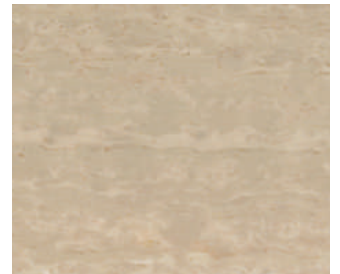
Grey Veine Cut