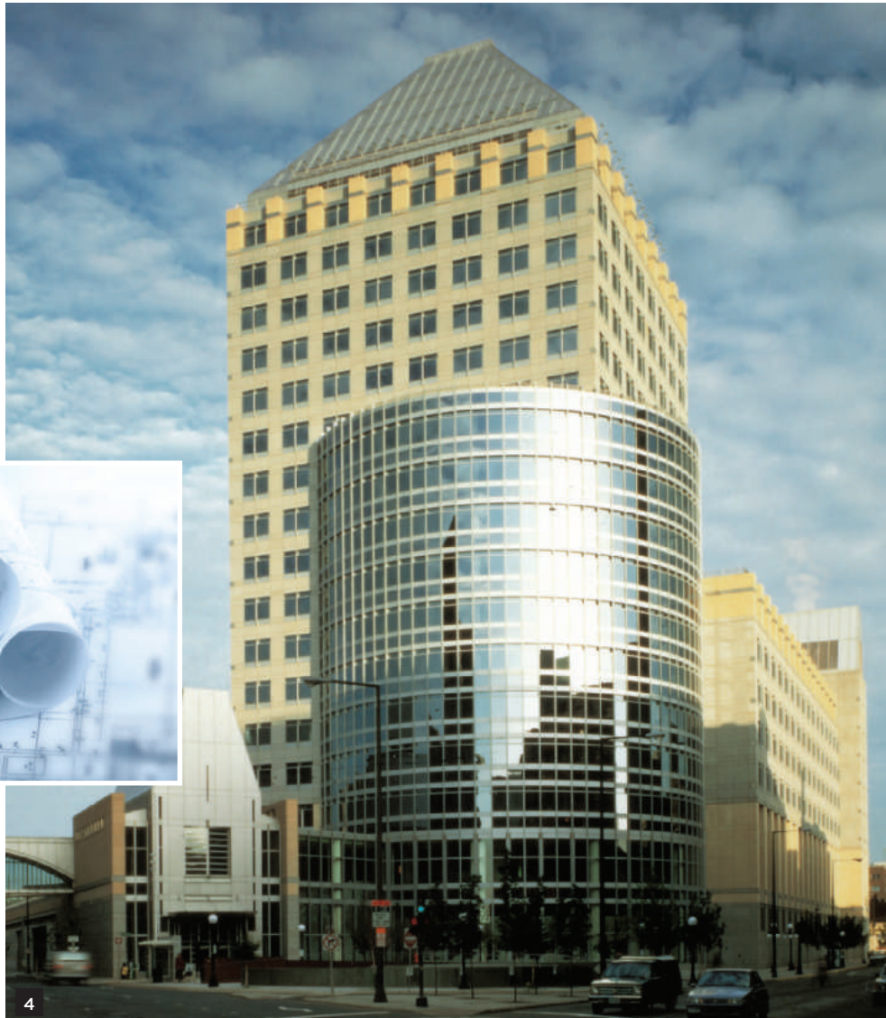
4 La Salle Plaza Minneapolis, MN