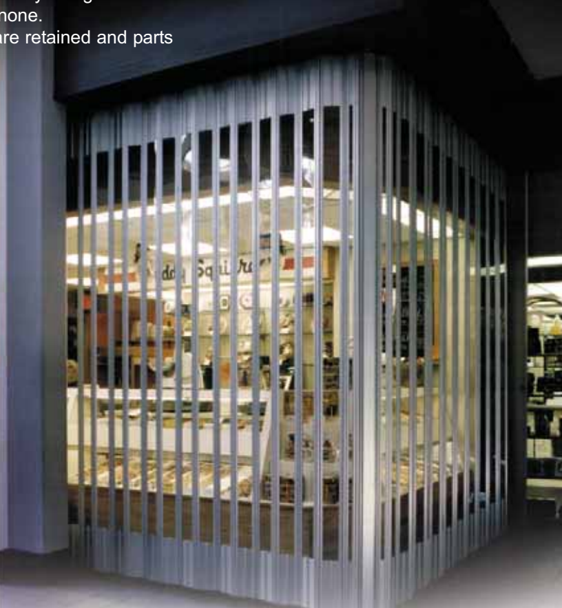
VistaGlide™ Model ESG31

These open design side folding grilles allow free circulation of air and visual access to the area being protected. The curtain is formed with a series of vertical 5/16" diameter aluminum tubes on 2" centers. Horizontal chains formed of eyeletted aluminum links are spaced at 12" apart. A series of 6" high extruded aluminum interlocking hinged pivot panels span the top and bottom of the curtain. Vertical hanger rods mounted to rollers that slide in the overhead track support the curtain. For added security, the chains may be specified to be spaced at 9", 6" or 3" apart.