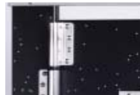
8" Aluminum Wrap-Around Hinge