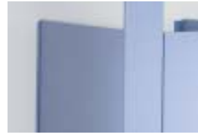
Plastic Continuous Wall Bracket

Using CAD/CAM software and state-of-the-art routing equipment, we can now engrave your company logo or a variety of symbols on compartment doors. Please contact Scranton Products (Santana/Comtec/Capitol) for additional details.