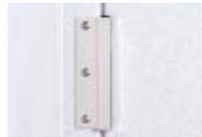
6" Aluminum Strike & Keeper