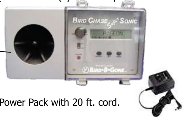
Internal Speaker Pod