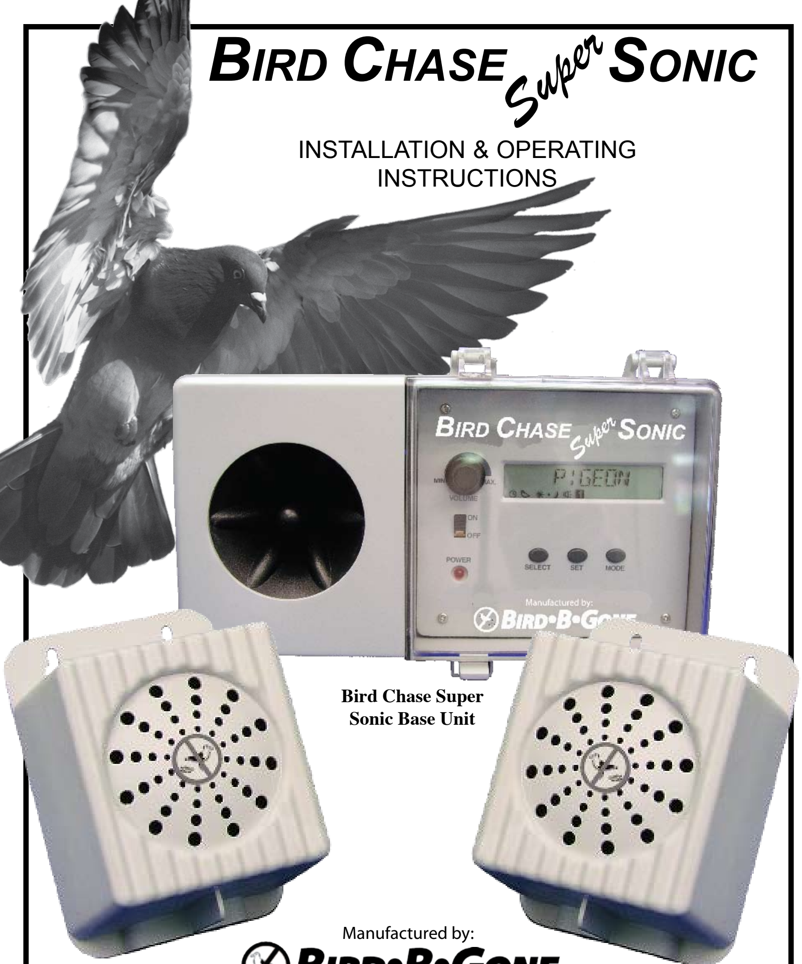
Bird Chase Super Sonic Base Unit