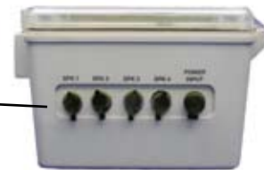
Add Additional Speakers Here!