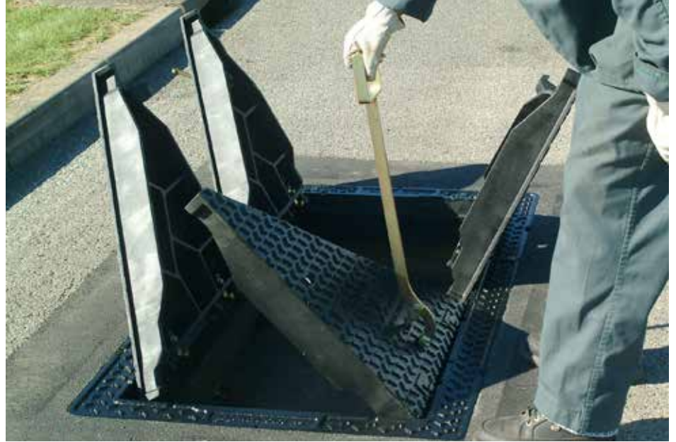
The MULTILEAF range of hinged and locked covers are produced in France.

Optional lift assist greatly reduces effort to open and close cover.