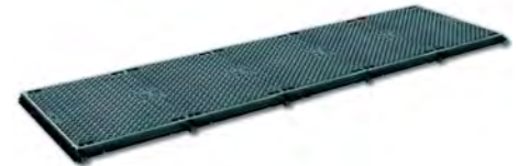
Continuous duct cover