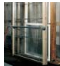
Alside window products are tested to the highest standards in our own on-site testing facility.