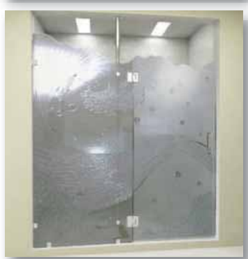
Floor-to-Ceiling Mount System

Includes: Gaskets. Screws. Glass Fabrication Details