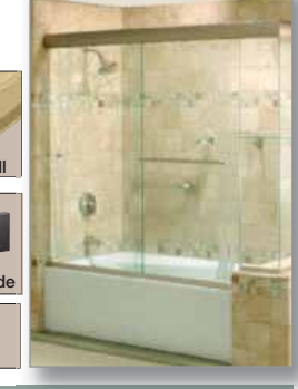
Revolutionary Cottage 'CK' Series with Clear Jambs for the 'All-Glass' Look, or Traditional 'DK' Series with Metal Jambs