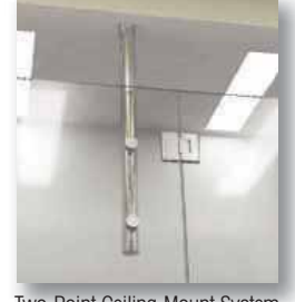
Two-Point Ceiling Mount System