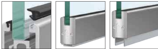
Top Load E.P.D.M. Glazing Gasket