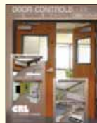
Door Controls Hardware and Accessories