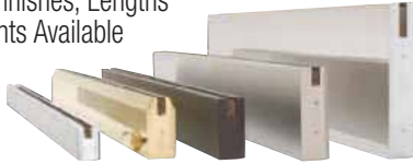
2-5/16" Low Profile 4" Tapered 4" Square 6" Square 10" Square