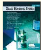
Glass Bonding System