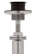
Flush Mount Glass Attachment with Swivel Type Head

To complete CRL's Spider Fitting line, they offer two types of Combination Glass Attachments, Rigid or Swivel. Rigid for exact placement of panels and Swivel that allows up to 6 degrees of tilt in any direction before securing in place. These Attachments allow for the glass mounting to be either with countersunk or standard holes. They can accommodate from 3/8" to 13/16" (10 to 20 mm) tempered glass and are also made of durable 316 alloy stainless steel.