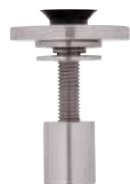
Flush Mount Glass Attachment with Rigid Type Head