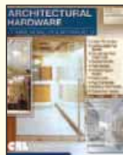
Commercial Door Hardware