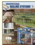
Architectural Railing Systems