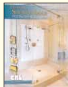
Frameless Shower Door Hardware and Supplies