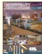
Hospitality & Service Hardware