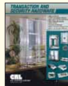
Transaction and Security Hardware