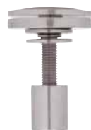
Cap Mount Glass Attachment with Rigid Type Head