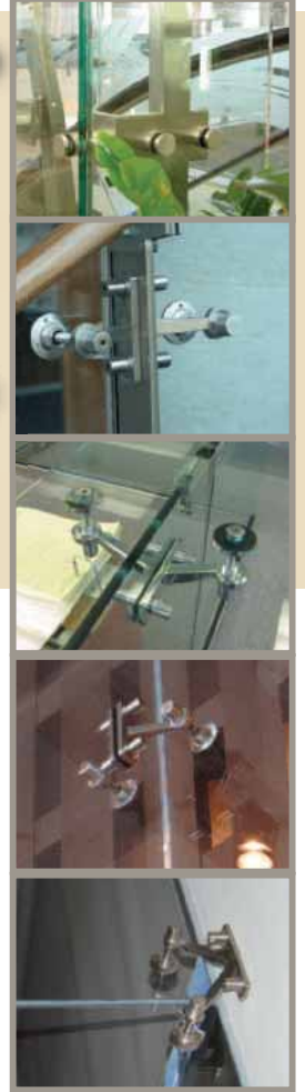
CRL Four Arm "V" Mini Post Mount Fitting