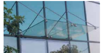
Glass Awning Support System