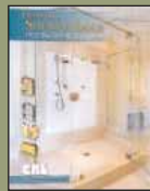
Frameless Shower Door Hardware and Supplies SD10