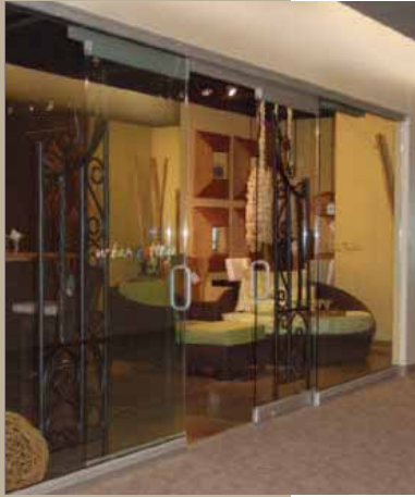
Heavy Glass Sliding Door System