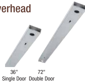
36" Single Door 72" Double Door