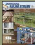
Architectural Railing Systems HR11