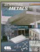
Architectural Metals AM09

CRL Specialty Catalogs - Can be ordered, viewed or downloaded online at crlaurence.com