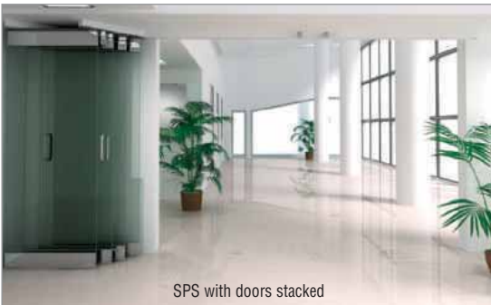
SPS with doors stacked