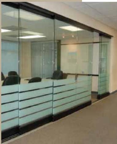
SDR Bottom Rolling Sliding Door System