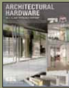
Architectural Hardware AH11