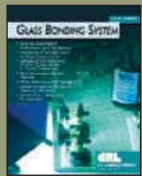
Glass Bonding System GB10