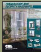
Transaction and Security Hardware TH10