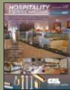
Hospitality & Service Hardware HS07