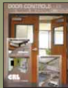
Door Controls Hardware and Accessories DC07