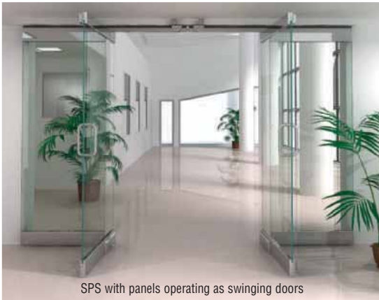
SPS with panels operating as swinging doors