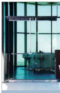
Electronic Egress Handles