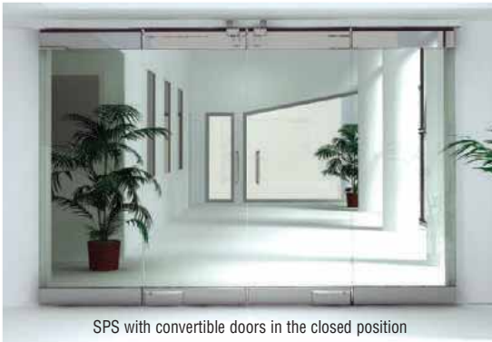
SPS with convertible doors in the closed position