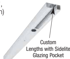
Custom Lengths with Sidelite Glazing Pocket