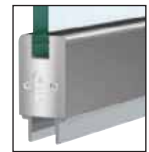
Reversible Saddle Positioned for 3/4" (19 mm) Clearance