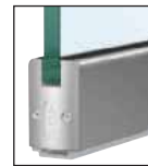
Reversible Saddle Positioned for 1/4" (6 mm) Clearance