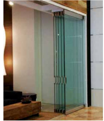
SPS Stacking Partition System for Heavy Glass