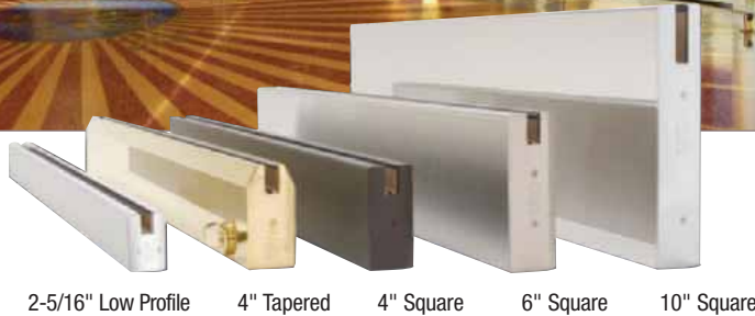
2-5/16" Low Profile 4" Tapered 4" Square 6" Square 10" Square