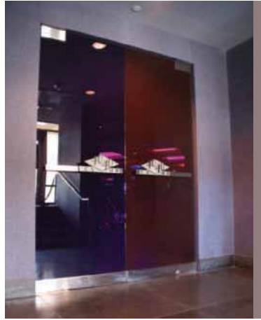
Door and Sidelite Rails, Patch Fittings