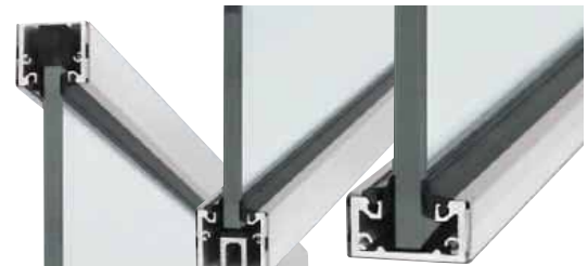
Regular U-Channel with Aluminum/Neoprene Setting Block