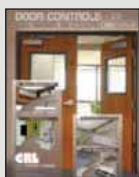
Door Controls Hardware and Accessories