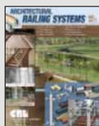
Architectural Railing Systems