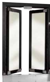
Flush Mount Manual Model (Viewed from Clerk's Side) BFW1DU