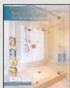
Frameless Shower Door Hardware and Supplies