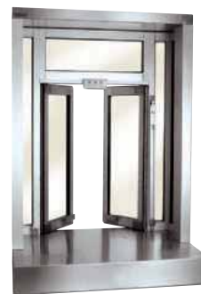
Projected Manual Model (Viewed from Clerk's Side) BFW2DU