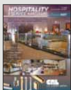
Hospitality & Service Hardware