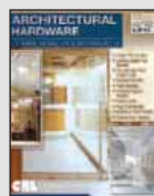
Commercial Door Handles