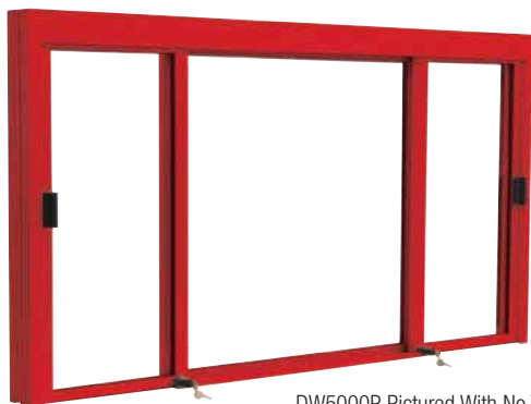
DW5000P Pictured With No Track Under Sliding Panels and Keyed Locks BFW2A