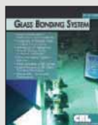
Glass Bonding System