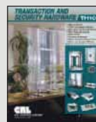
Transaction and Security Hardware