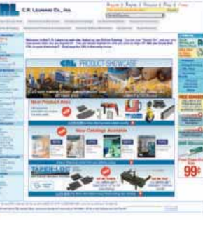
Access to All CRL Products Through the Easy-to-Use A to Z Product Index

C.R. Laurence Company has a Technical Sales Department to assist with design plans and installation questions. Your job can be made easier with the help of CRL's Technical Sales Representatives who are trained in the newest Hardware Systems, and can offer you detailed diagrams and layout sheets. Ask for Extension 7770.