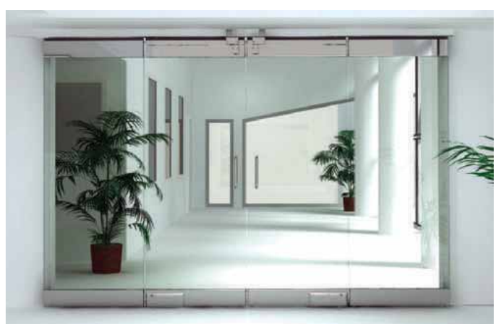
SPS System With Convertible Doors in the Closed Position