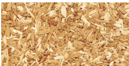
Light, Medium and Dark (medium shown)