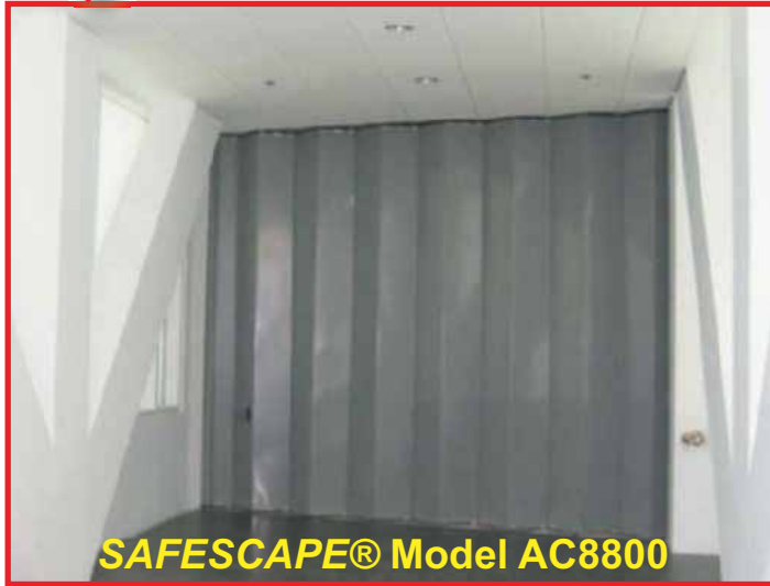
SAFESCAPE® Model AC8800