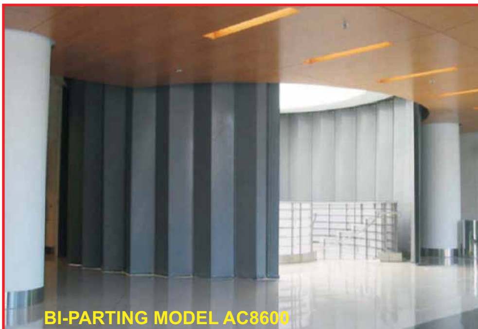
BI-PARTING MODEL AC8600