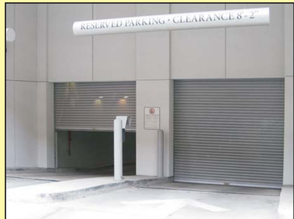
Perforated Service Doors Used In High Cycle Applications