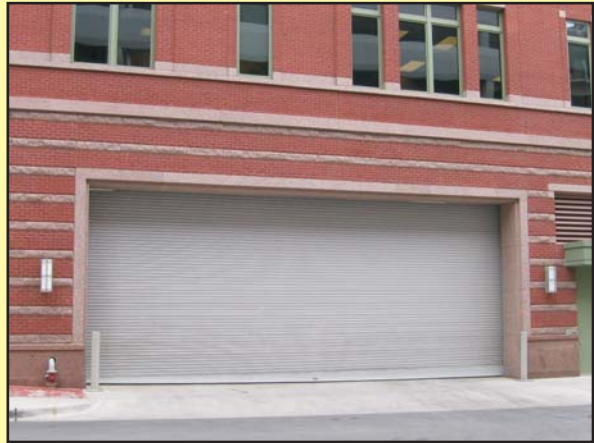
Model SD3016 Ideal For Security & High Cycle Applications

Applications: Coiling Service Doors are ideal for exterior and interior applications. These doors are ideal in applications where durability, frequent cycling, or severe exposure is an issue. Coiling Service Doors are primarily used in parking facilities, port authorities (piers or airports), transit authorities, sanitation departments, environmental control facilities, and other heavy industrial applications.