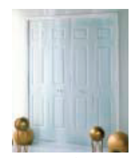
Regency Steel Bifold