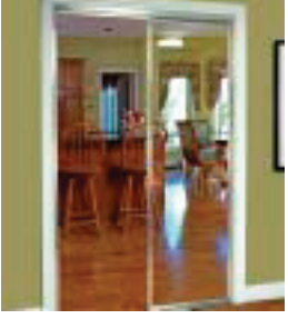
4550 Aluminum Framed Sliding Mirror Door with Bottom Roller