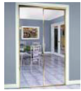
4260 Steel Framed Sliding Mirror Door with Bottom Roller