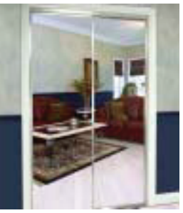
7023 Aluminum Framed Sliding Mirror Door with Bottom Roller (Wide Stile)