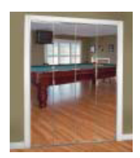
5002 Aluminum Frameless Bifold Mirror Door ■ Panels: 2 or 4