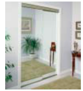
2007 Steel Frameless Sliding Mirror Door with