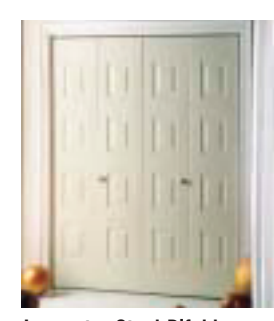
Lancaster Steel Bifold