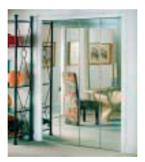
2700 Heavy-Duty Steel Bifold Door with Mirror Laminate