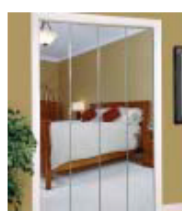
4900 Steel Frameless Bifold Mirror Door