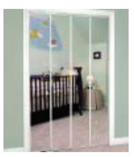
4400 Steel Framed Bifold Mirror Door ■ Panels: 2 or 4