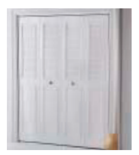
Classic Steel Bifold