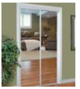
2020 Steel Framed Sliding Mirror Door with Bottom Roller (Wide Stile)