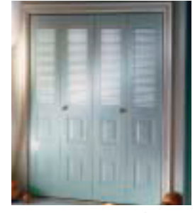
Westchester Steel Bifold