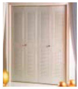
Louver II Steel Bifold