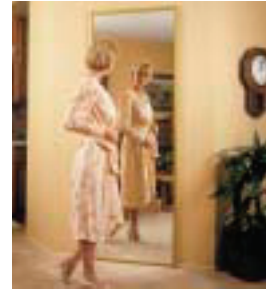
4100 Aluminum Overlay