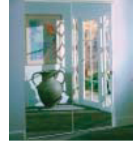
2200 Steel Sliding Mirror Door with Chrome Mylar