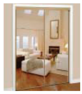
4050 Steel Framed Sliding Mirror Door with Top Roller