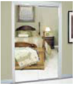
4760 Steel Frameless Sliding Mirror Door with Bottom Roller