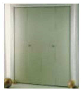
Flush Steel Bifold