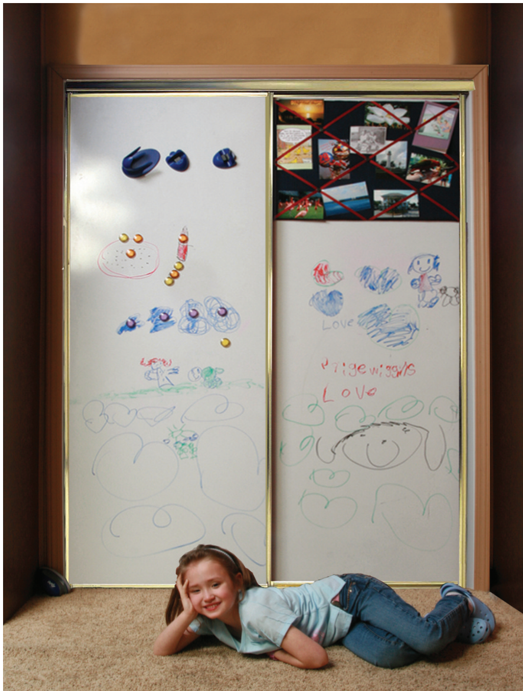
Shown in Satin Gold, inset shown in Architectural Brown