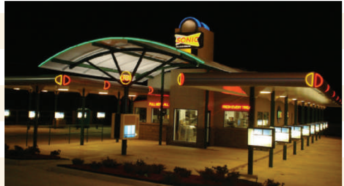
Image Resource Group protective covers and tensioned membrane structures will enhance the visibility, image, identity and appeal of any location and provide shelter and security.

fabricated in steel and aluminum, and may be covered by a variety of metal roofing products or a complete range of fabric