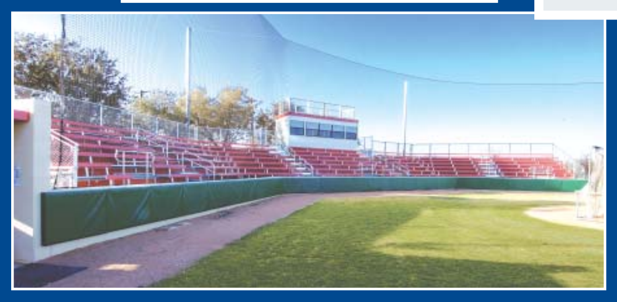
SHERMAN, TX - 7 row mitered baseball stadium that seats 528. Tongue and Groove 2001 decking system. 8' by 24' pressbox with observation deck. Designed, manufactured and installed by Southern Bleacher.

Critical seating layouts often include miters so the stadium conforms to the perimeter of playing fields. Our mitered designs ensure that ample seat dimensions and good lines of sight are maintained no matter what size the project.