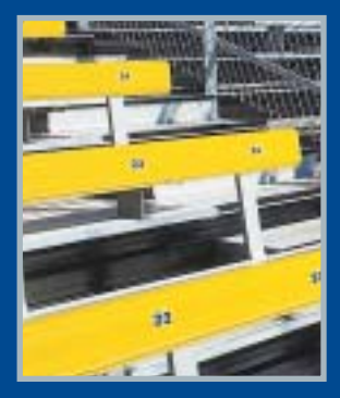
BENCH SEATING with OPTIONAL BACKRESTS