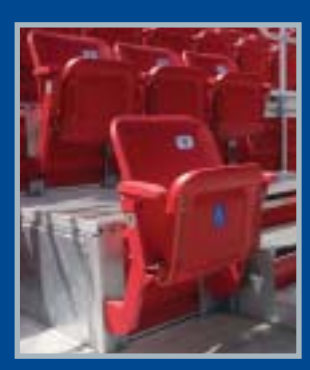
PLASTIC MOLDED CHAIR