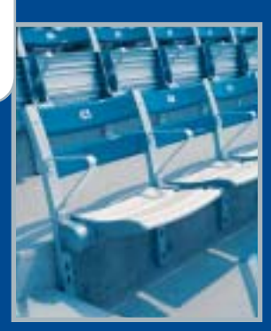
SOBCO 5000 CHAIR