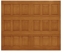
6.5' and 7' high vertical style