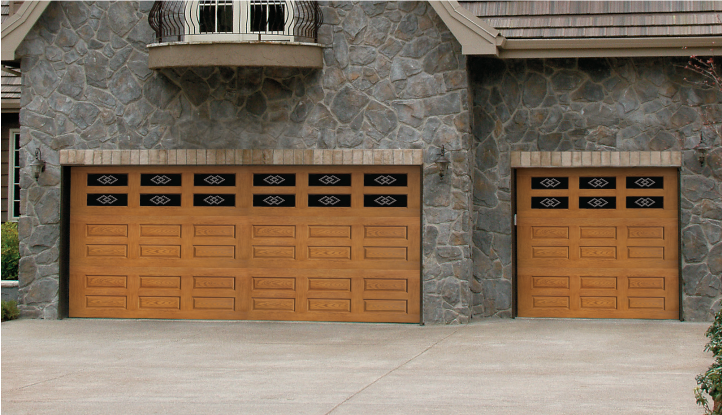
Model 9800 shown in horizontal design with Radiance Double Diamond Lites