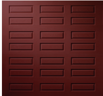
8' high horizontal style