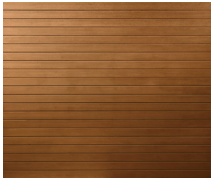
7' high horizontal V-groove style