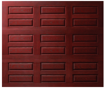
6.5' and 7' high horizontal style