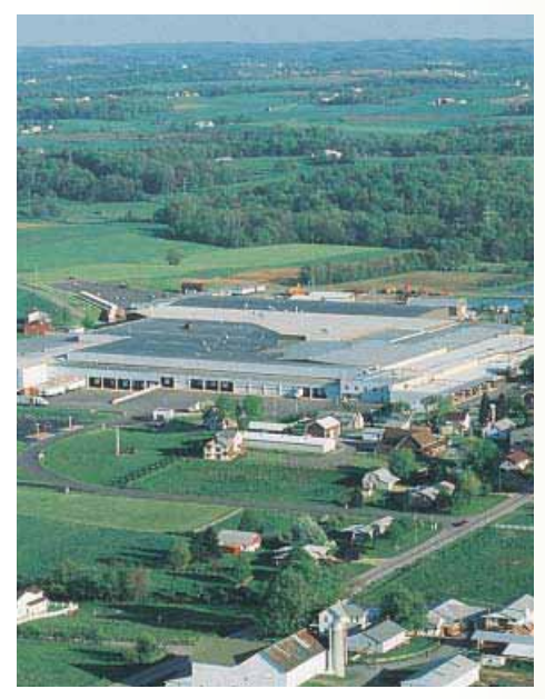
Mt. Hope, Ohio