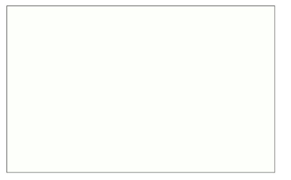
Bone White UC43350