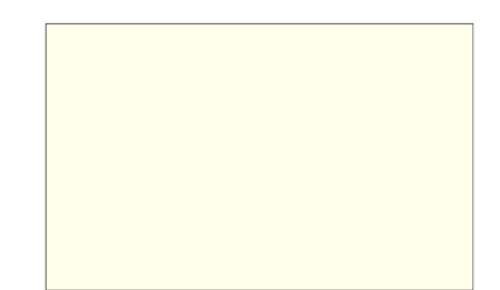
Colonial White UC54983