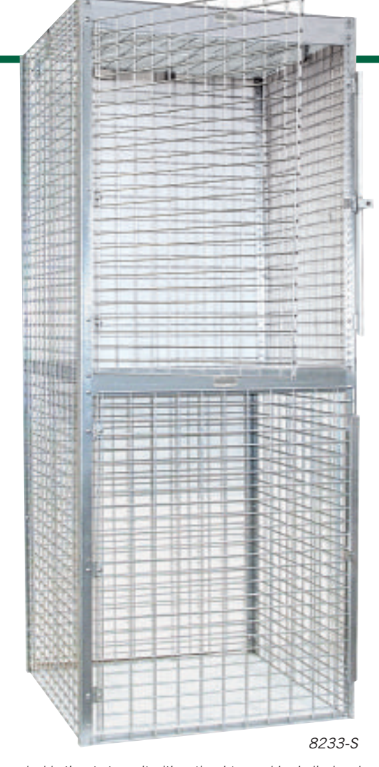
double tier starter unit with optional top and back displayed