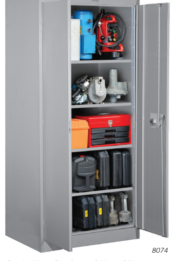
Standard Heavy Duty Storage Cabinet - 24" deep