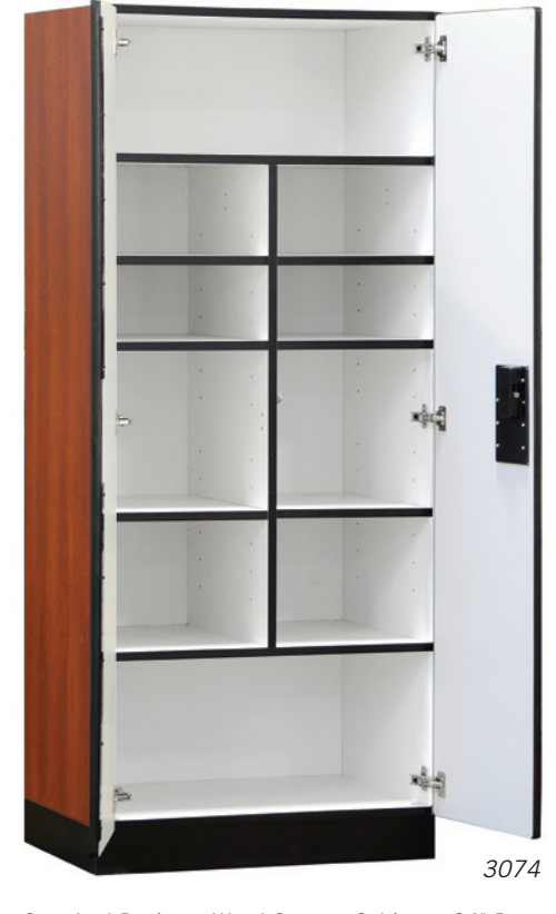
Standard Designer Wood Storage Cabinet - 24" Deep