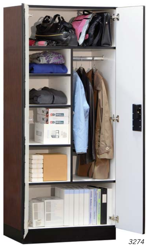
Wardrobe Designer Wood Storage Cabinet - 24" Deep