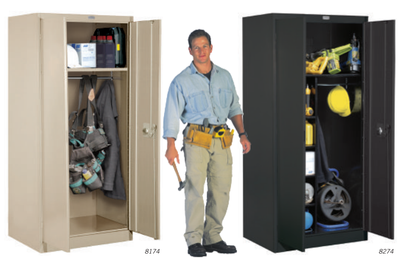
Wardrobe Heavy Duty Storage Cabinet - 24" deep