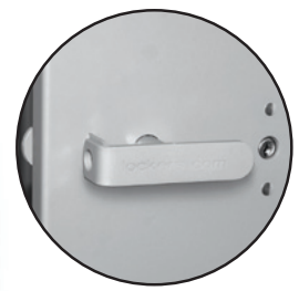
4" heavy duty steel handle